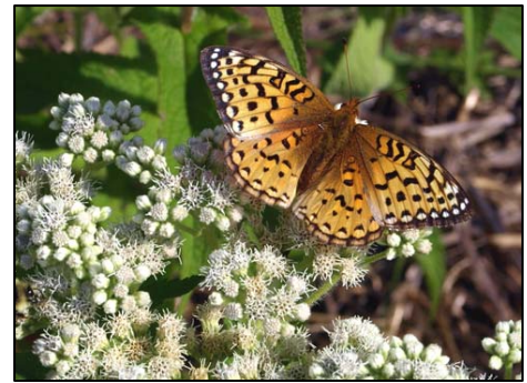
Butterfly on Boneset