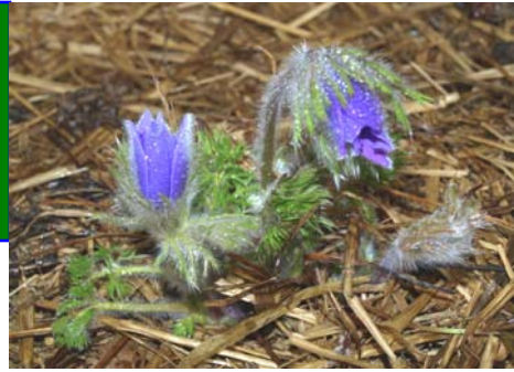
Harbinger of Spring