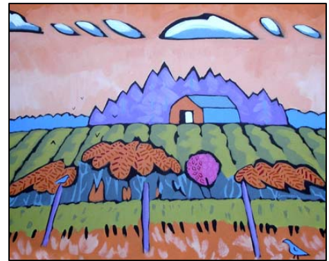
Union Road, Paula Swenson